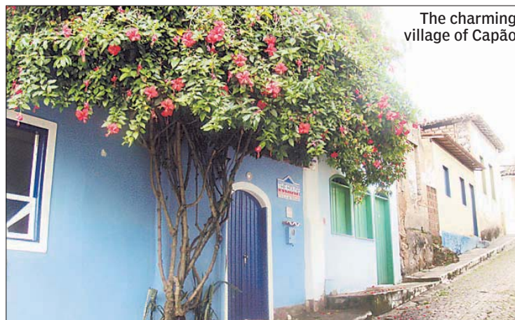
The charming village of Capão

Our first day in Chapada Diamantina, I bargained with the guides for a cheaper trek, in broken Portuguese peppered with highly emotional sign language. Tired with negotiations, albeit with the sweet satisfaction of getting a cheap deal, we spent the rest of the day swimming in a waterhole outside Lençóis. Knowing that the next three days would be spent in the wild, we all drank Caipirinhas and ate rich, cheesy tapioca pancakes before hitting the sack.